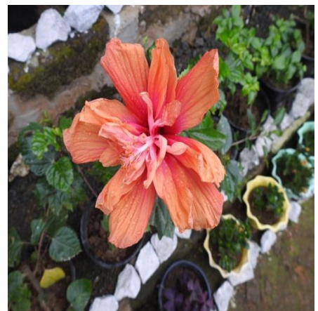
Hibiscus rosa sinensis