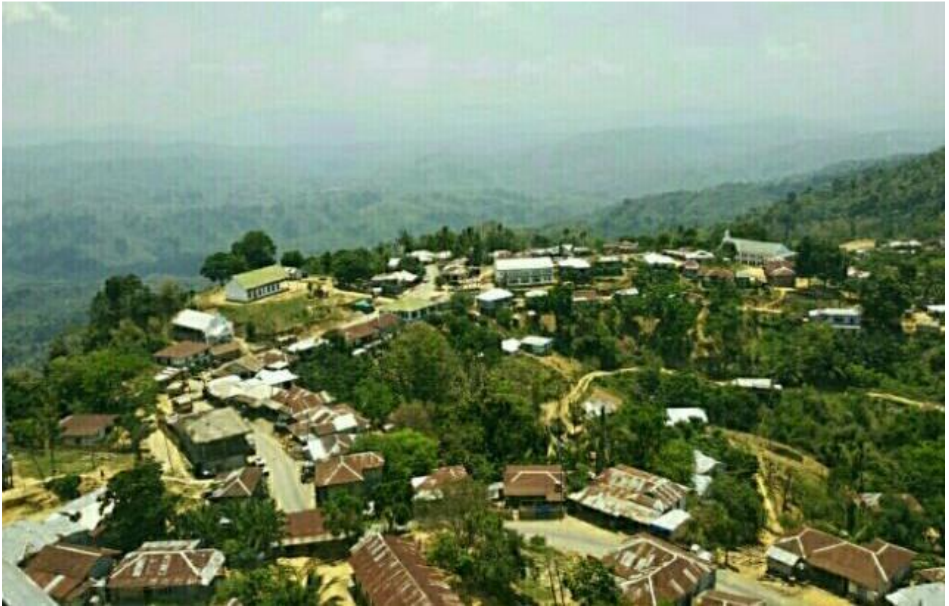
S. Lungrang Village