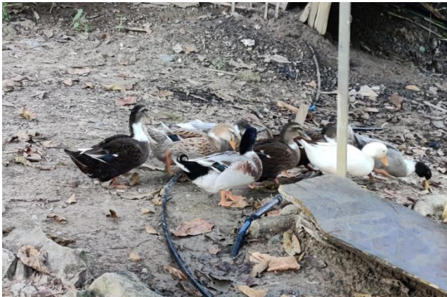
Anas platyrhynchos domesticus