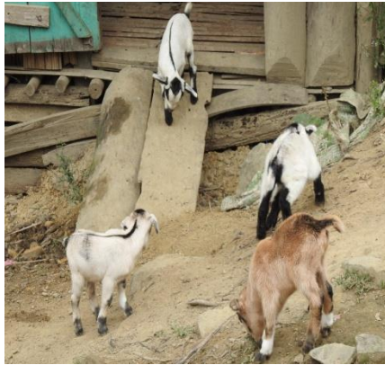
Capra aegagrus hircus