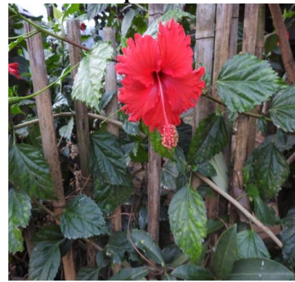
Hibiscus rosa sinensis