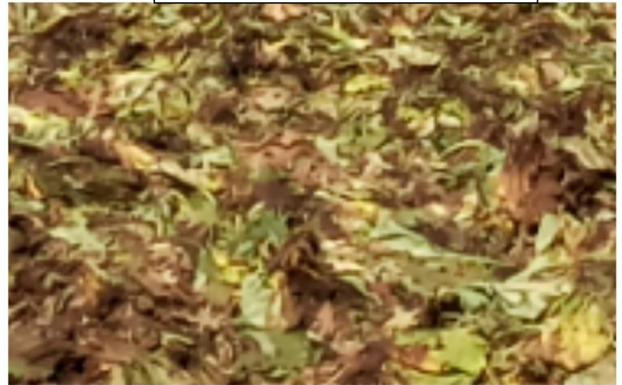
Processing of tobacco leaves