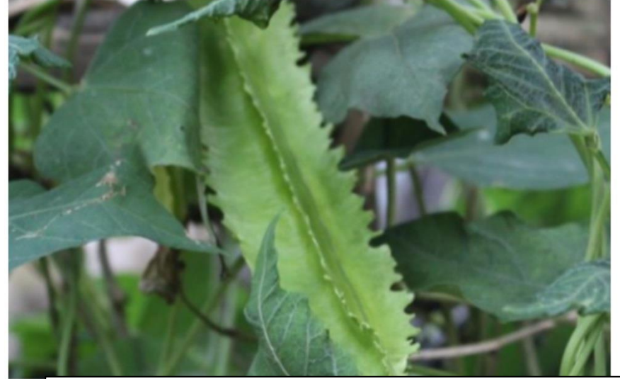
Psophocarpus tetragonolobus (Bepawr)