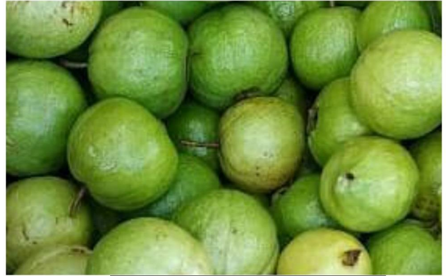
Psidium guajava (Kawlthei)