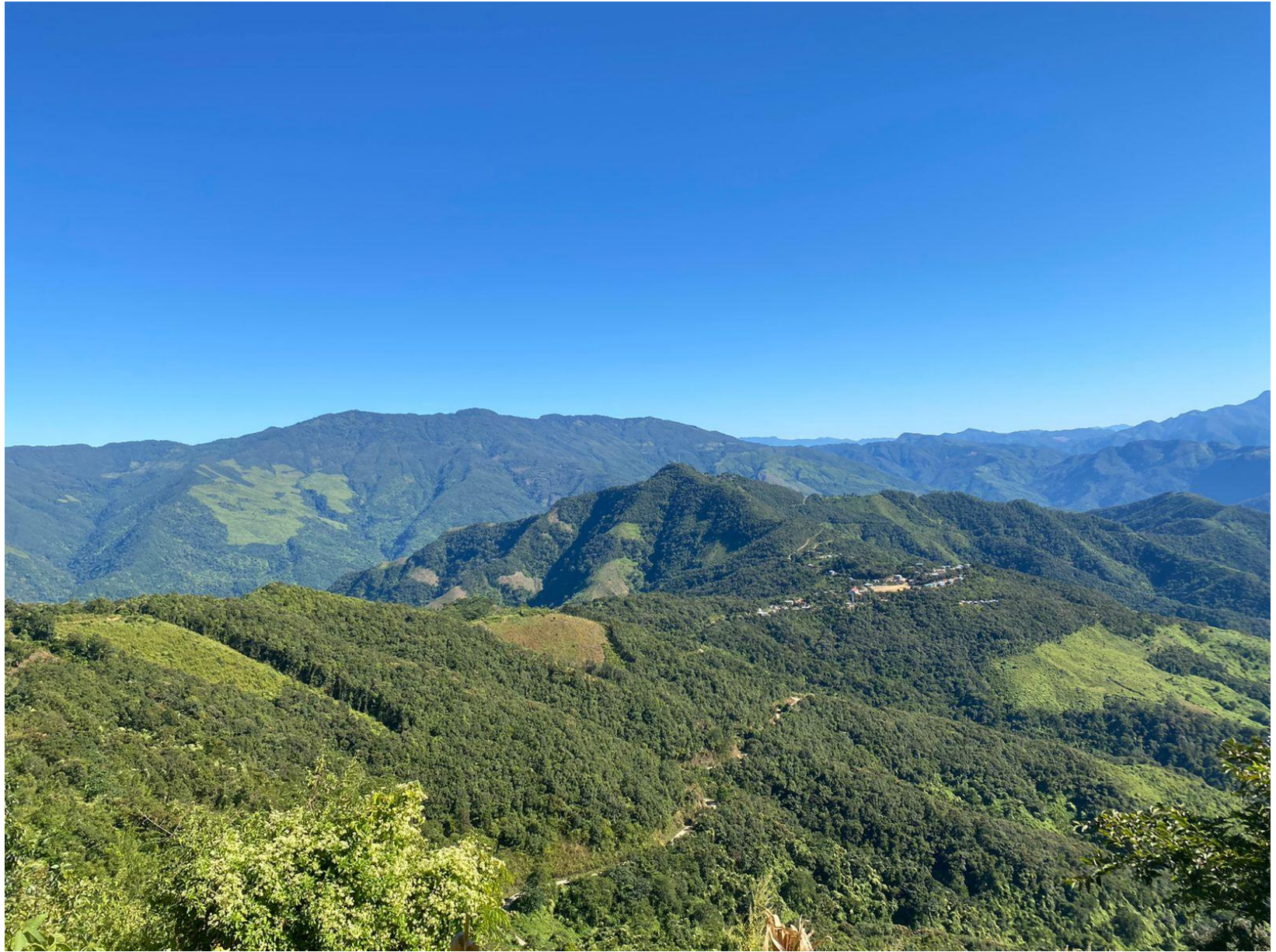
New Ngharchhip Village