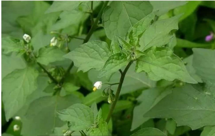
Solanum americanum (Anhling)