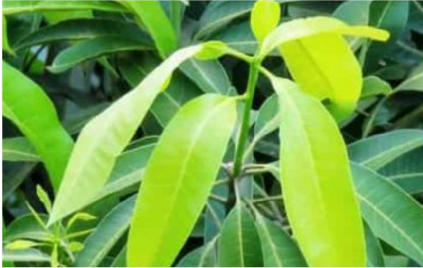
Magnifera indica (Theihai)