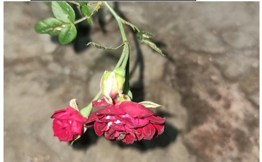
Rosa indica (Rose)