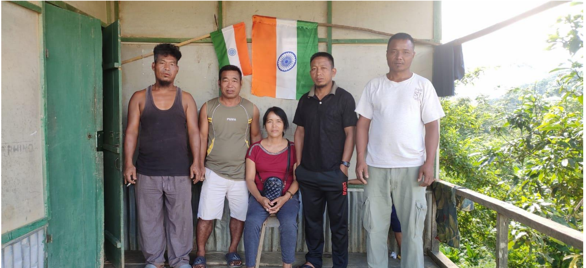
Biodiversity Management Committee : New Ngharchhip