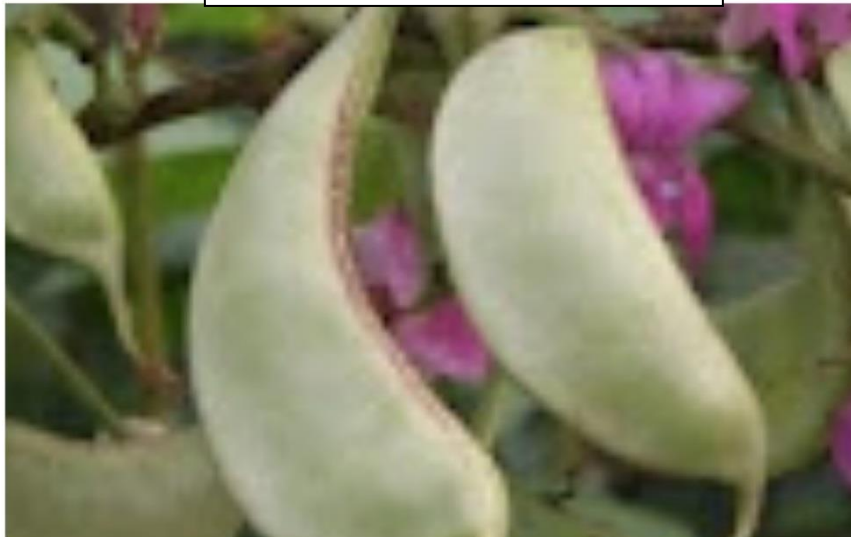
Lablab purpureus (Bepui)