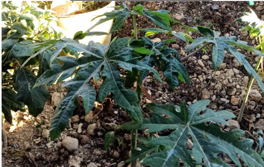
Carica papaya (Thingfanghma)