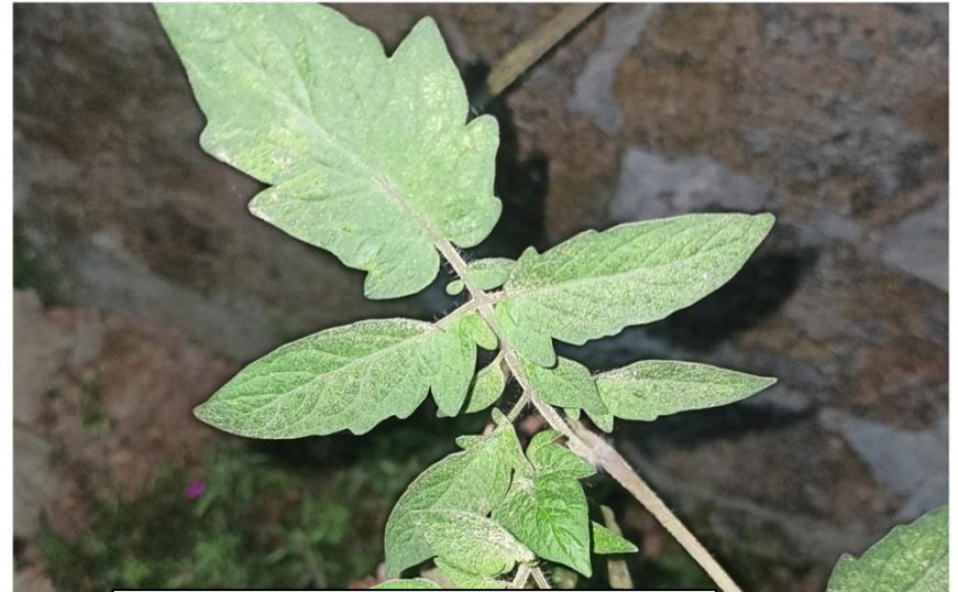
Solanum lycopersicum (Tomato)