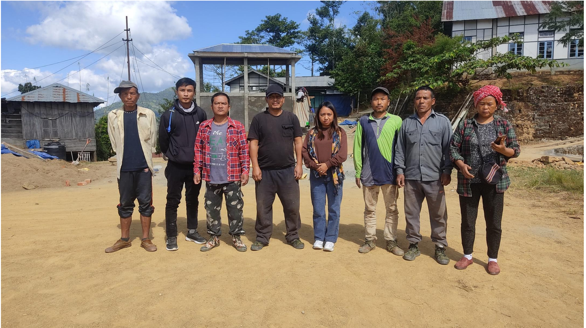
Members of Biodiversity Management Committee, Pehlawn