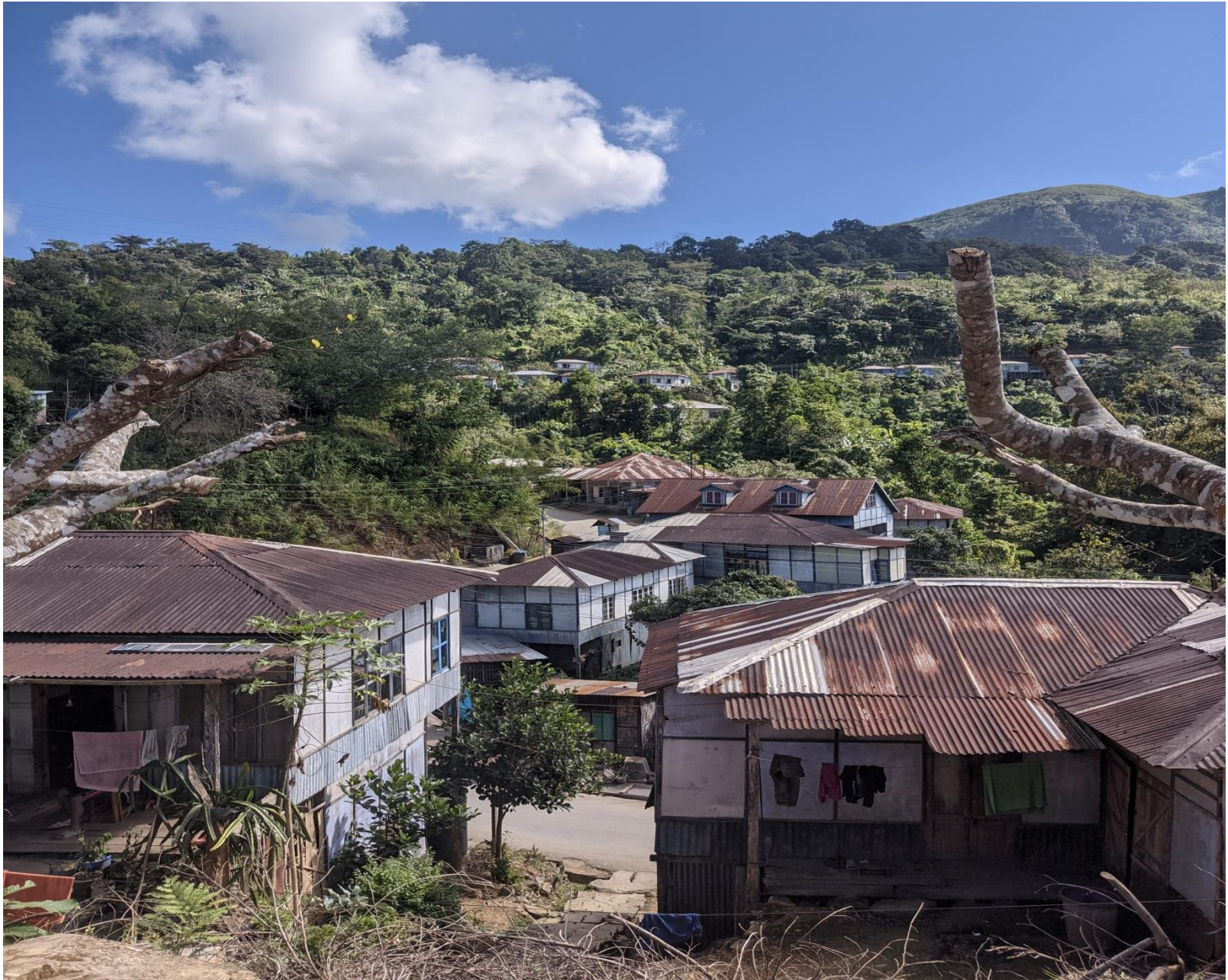
Village of Pehlawn