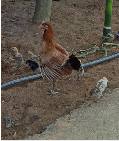
Gallus gallus domesticus