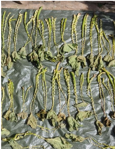
Dried Colocasia esculenta