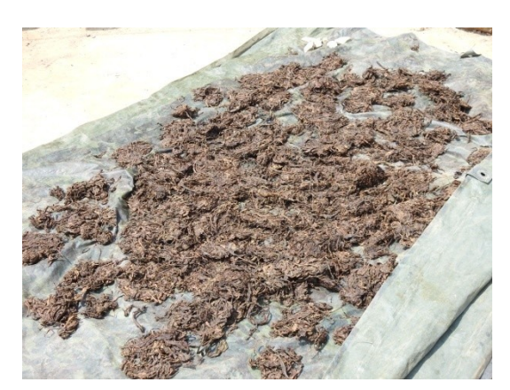
Sun dried Tobacco leaves