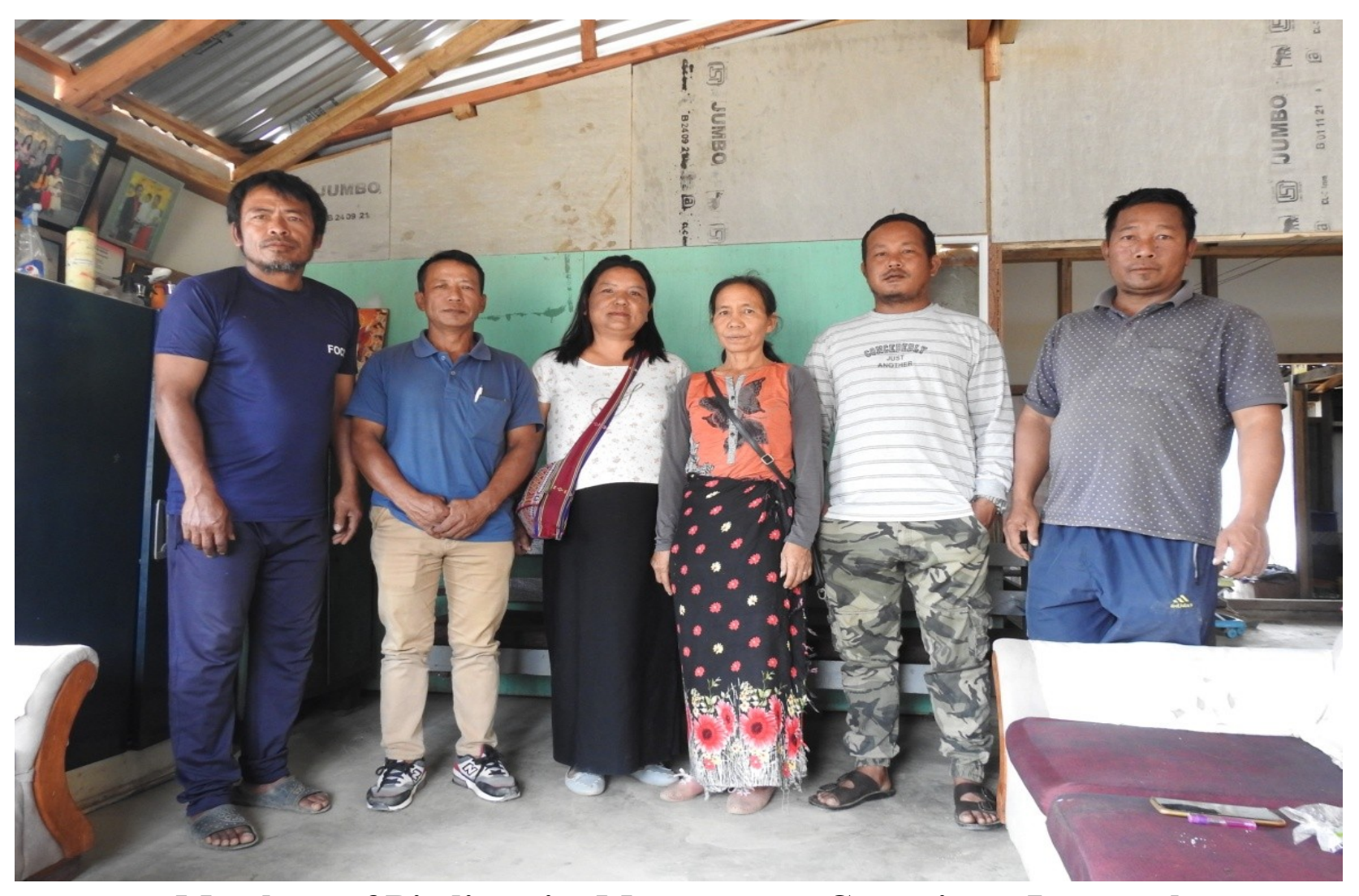
Members of Biodiversity Management Committee, Lamzawl