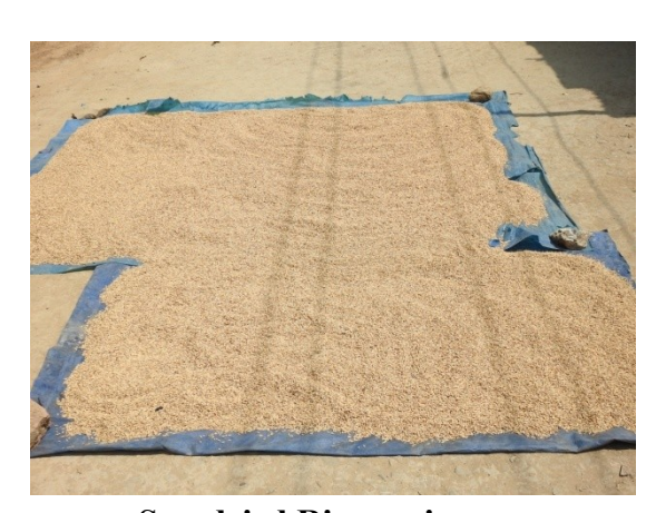
Sun dried Rice grain