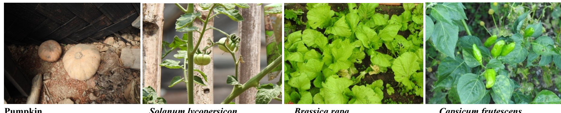
Solanum lycopersicon Pumpkin Brassica rapa Capsicum frutescens