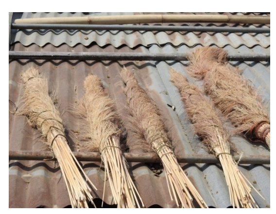
Sun dried Broomsticks