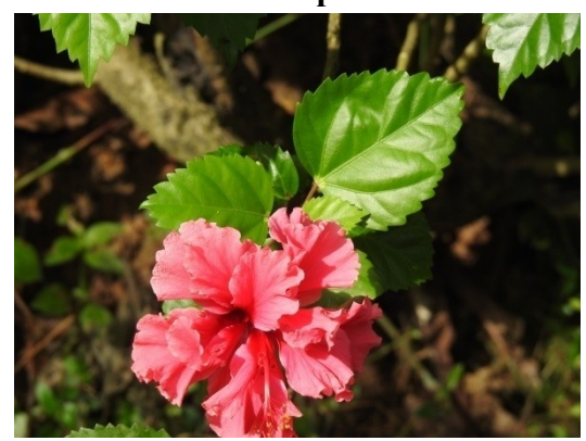
Hibiscus rosa sinensis