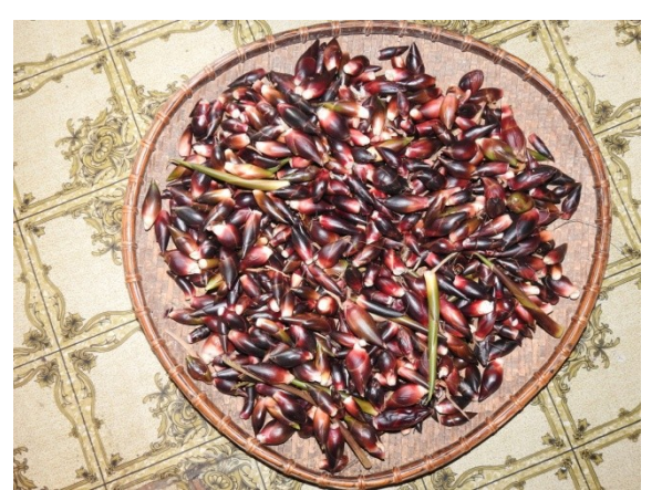
Collected Java cardamom Amomum maximum