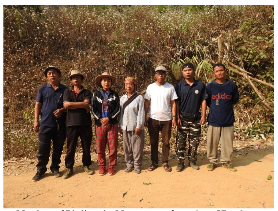
Members of Biodiversity Management Committee, Khawkawn