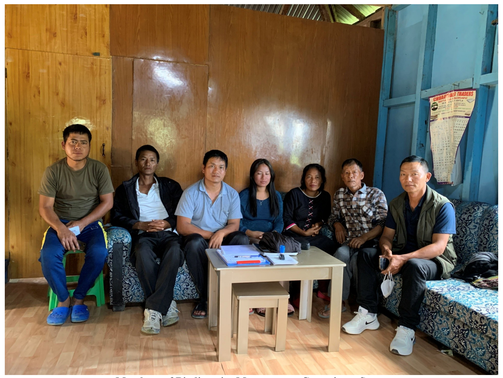
Members of Biodiversity Management Committee, Sazep