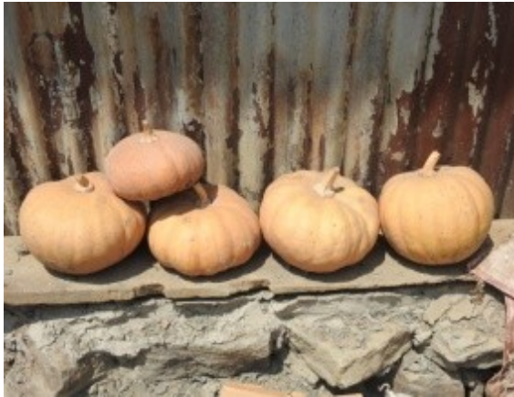
Ripped Pumpkin harvested from farm