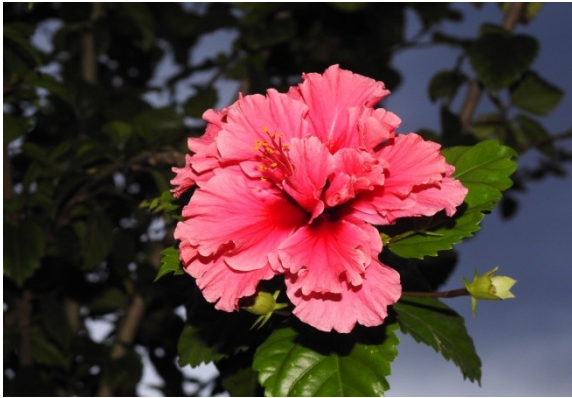
Hibiscus rosa sinensis