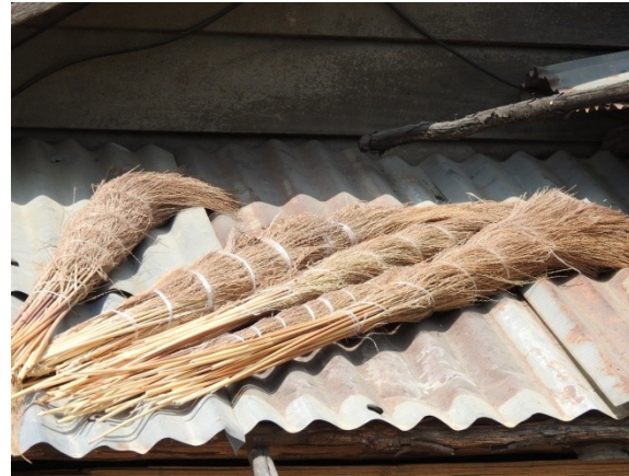
Sun drying of Broom