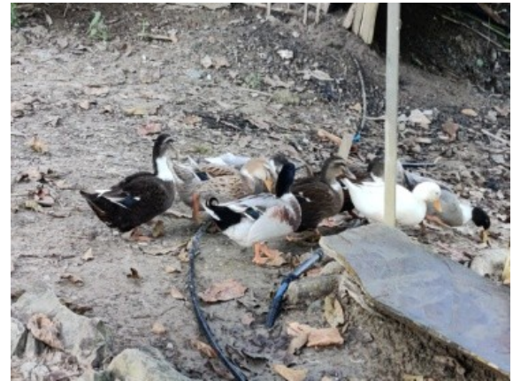
Anas platyrhynchos domesticus