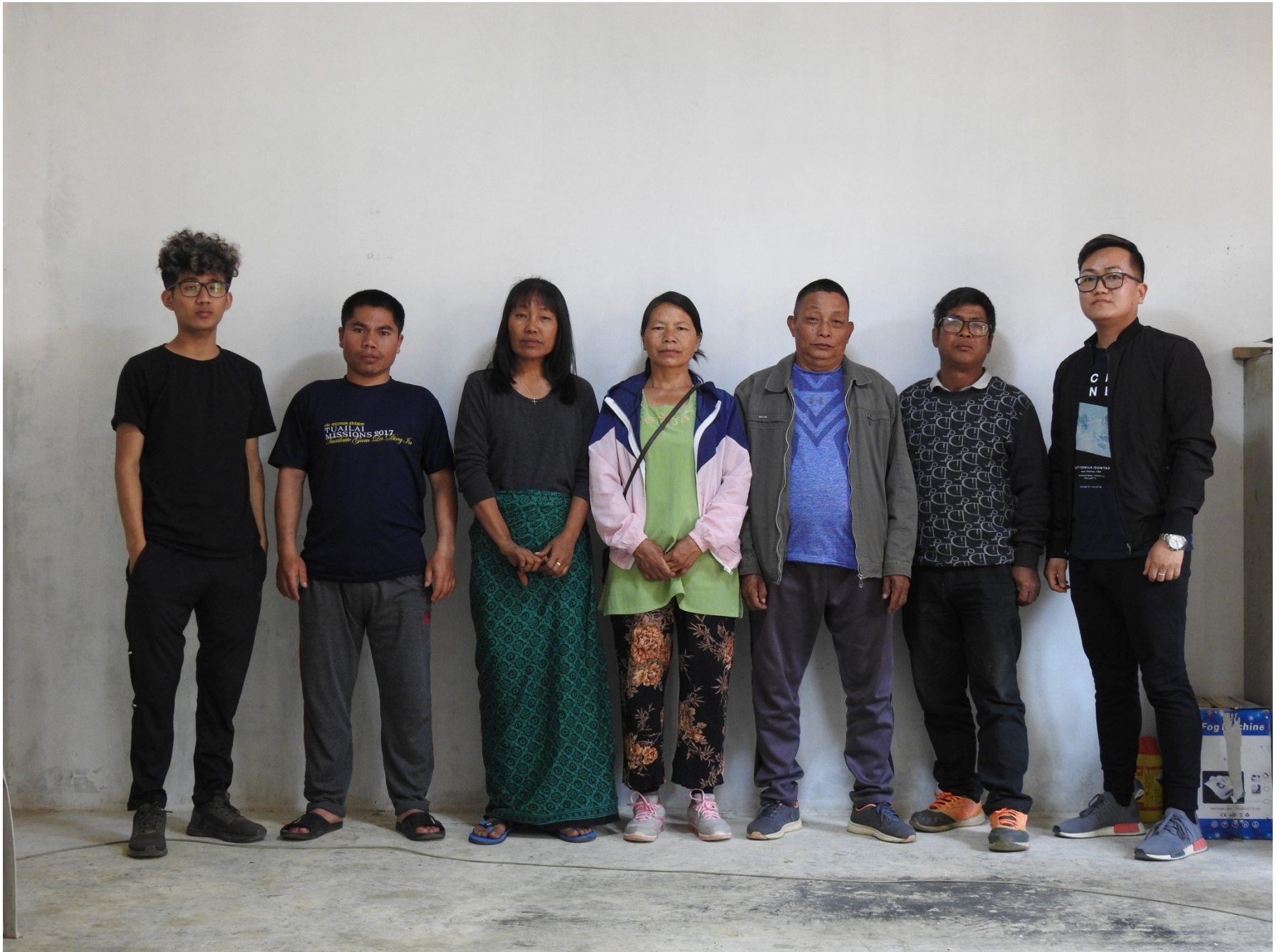
SBB Staff & Members of BMC Teikhang