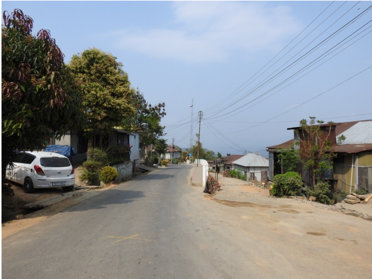
Street of Pawlrang Village