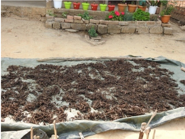
Sun drying of Tobacco leaves