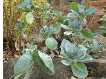
Brassica oleracea var. capitata