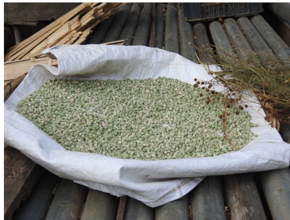
Sun drying of Green Peas