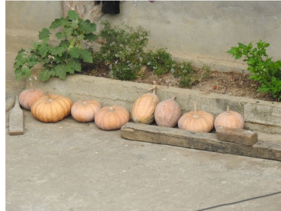
Collected Riped Pumpkin