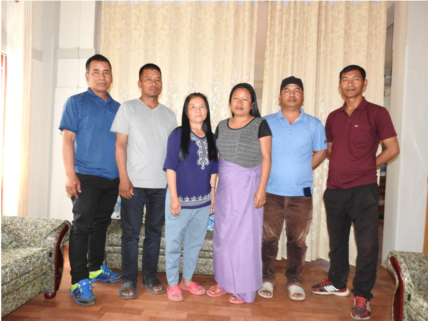
Members of Biodiversity Management Committee, Pawlrang