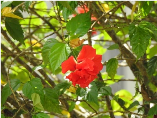
Hibiscus rosa sinensis