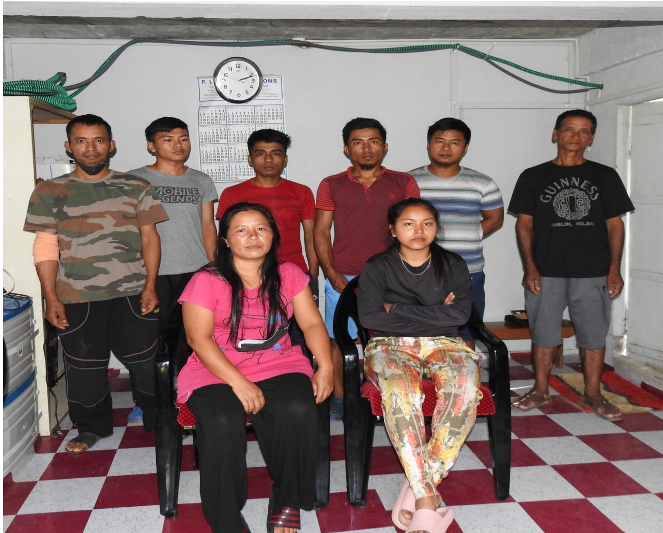
Biodiversity Management Committee Members, Hmuntlang