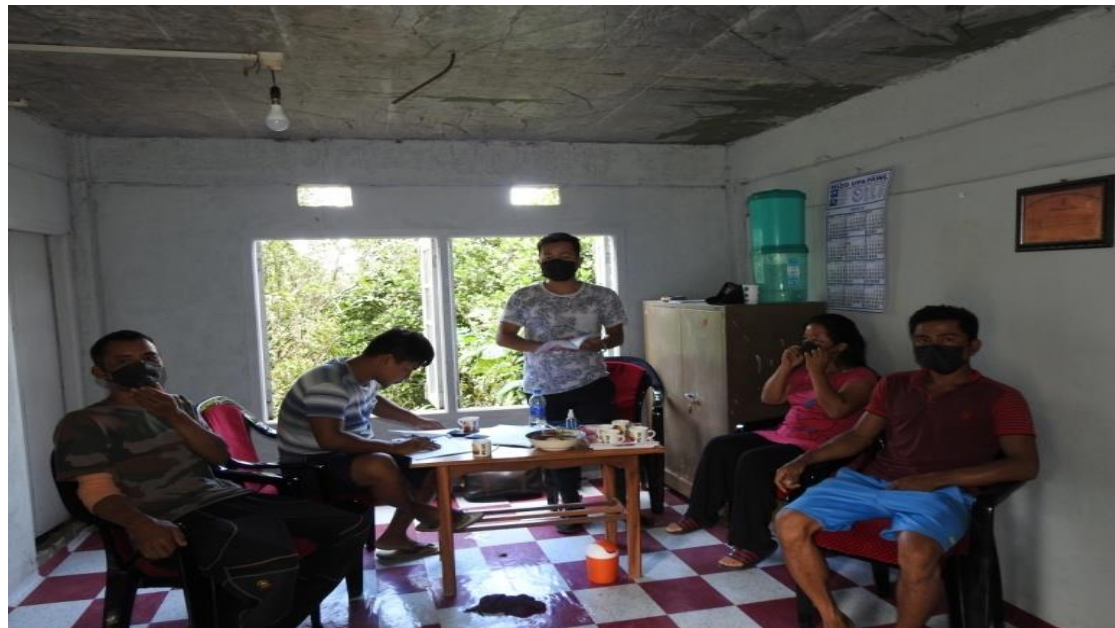
Meeting with BMC members