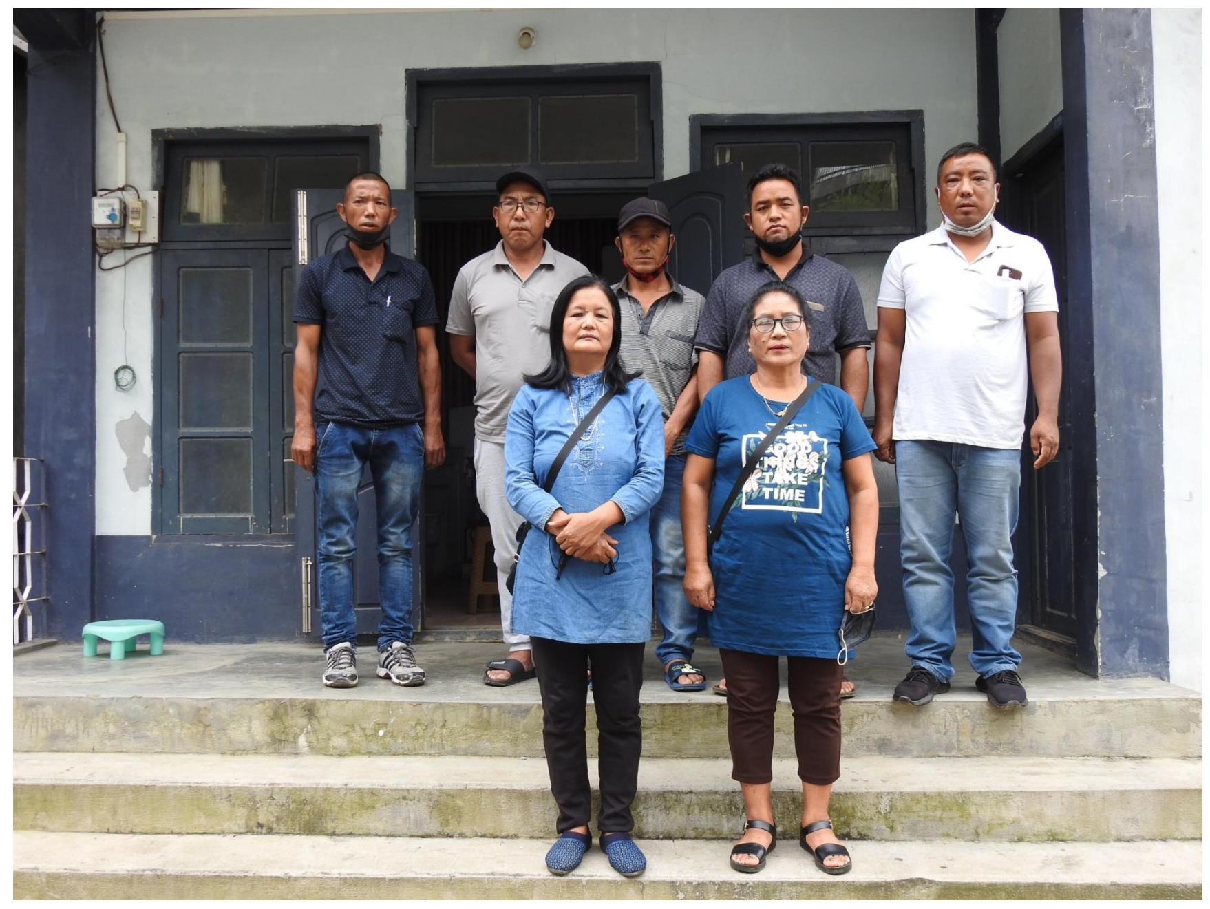
Members of Biodiversity Management Committee, Darzo