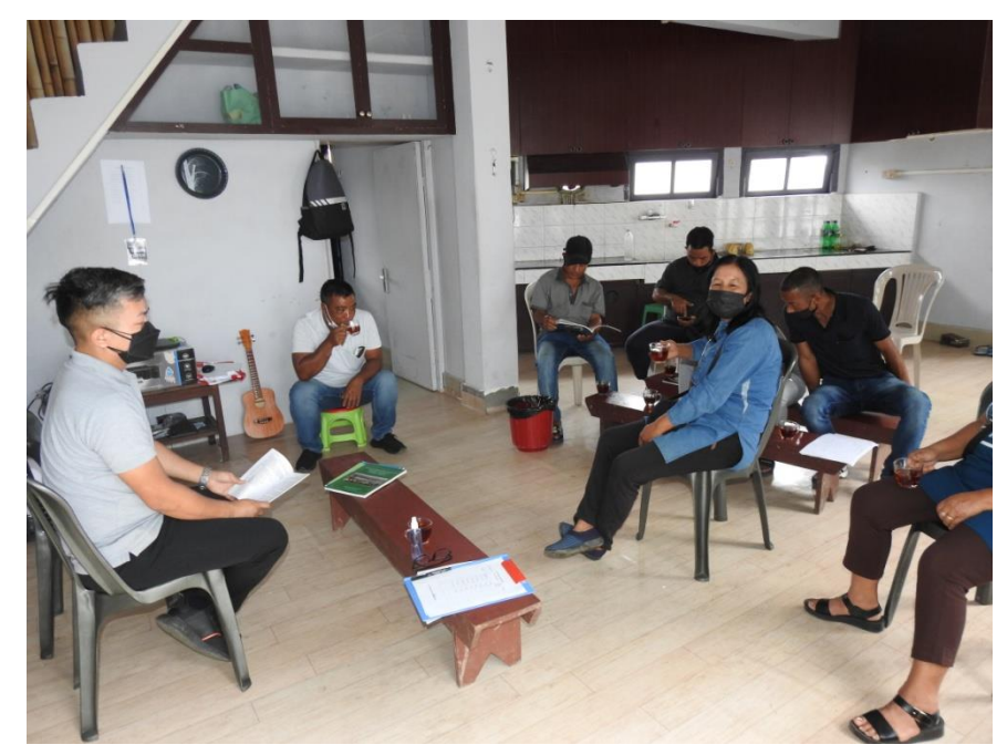
Interaction between SBB staff and BMC members