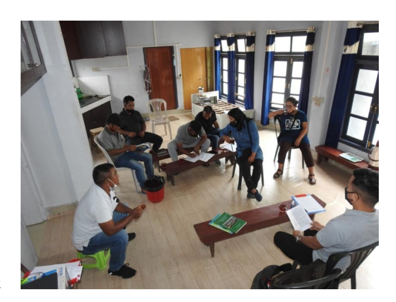
Darzo BMC members filling up PBR form at