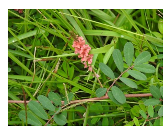
An unidentified weed found at Darzo Peak