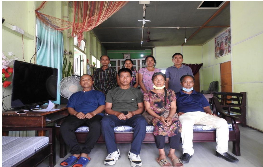
Members of Biodiversity Management Committee, Kanghmun S