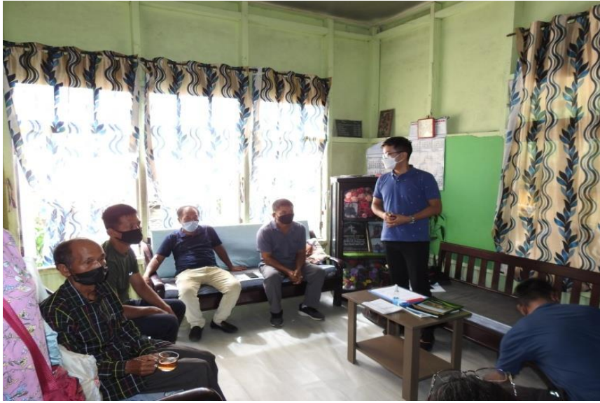
Meeting with BMC Members