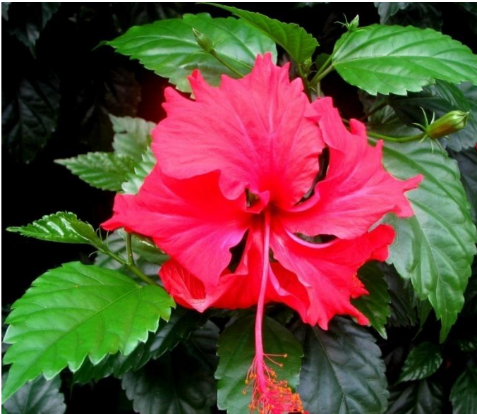
Hibiscus rosa sinensis