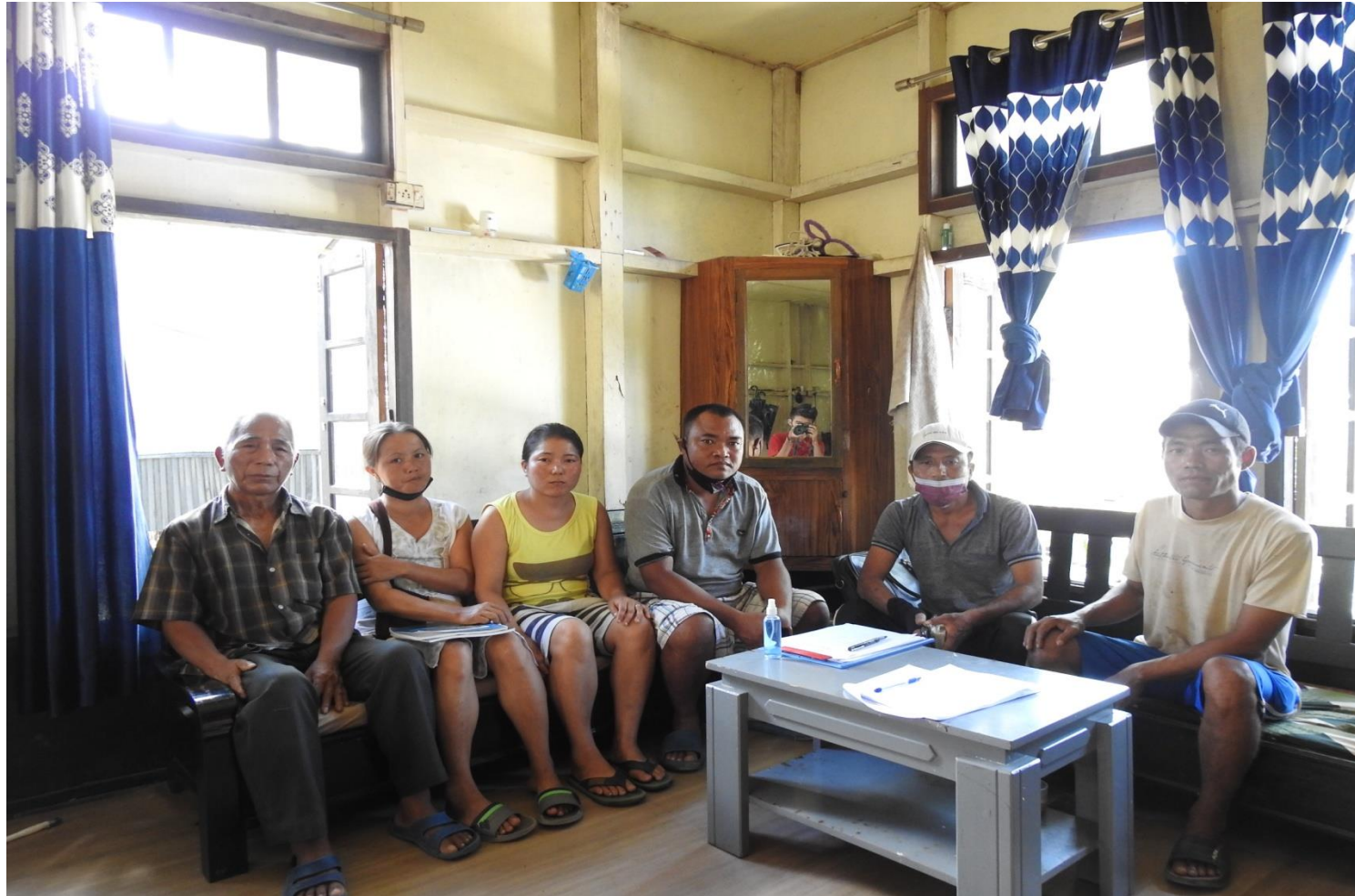
Members of Biodiversity Management Committee, Rotlang East