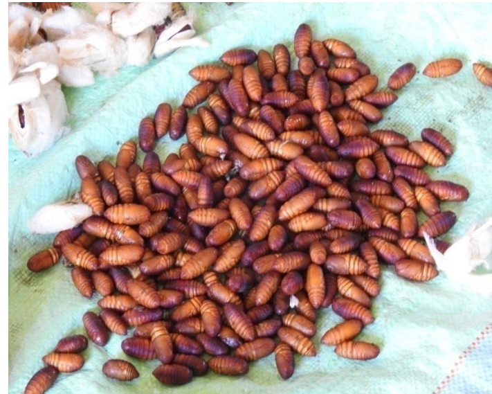
Rearing of Silkworm by Local people of Rotlang East