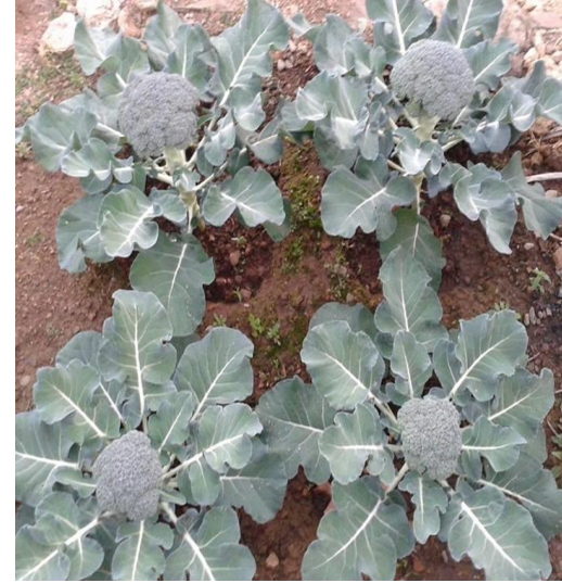
Brassica olearcea var italica